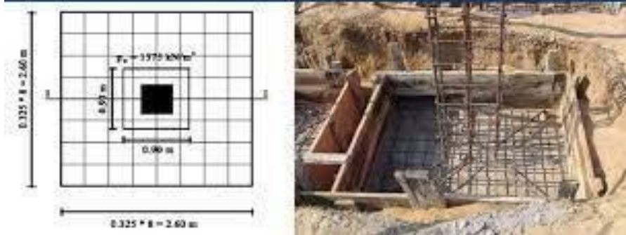
Foundation reinforcement detailing