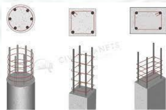
Different shape of the column with reinforcement