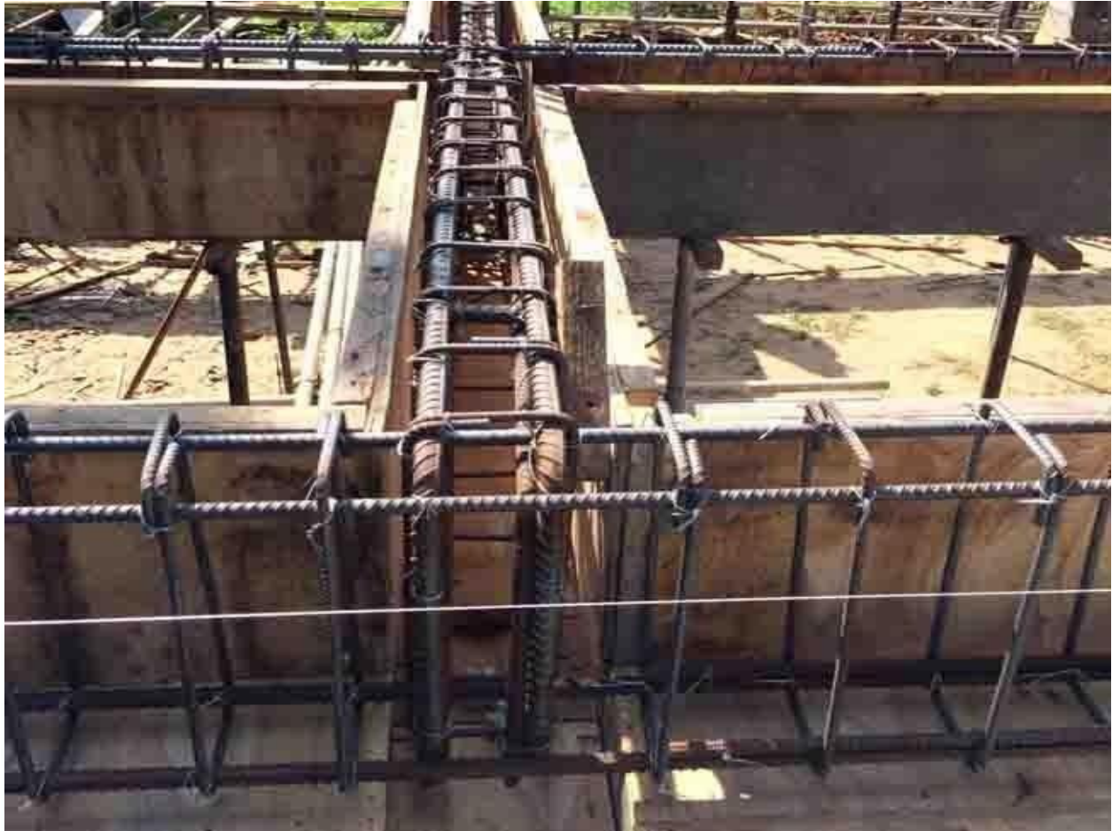
Reinforcement detailing for beam on the site