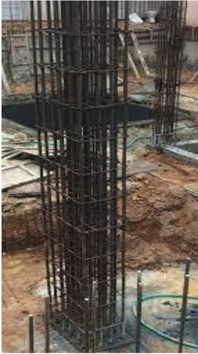
Reinforcement detailing for column in site