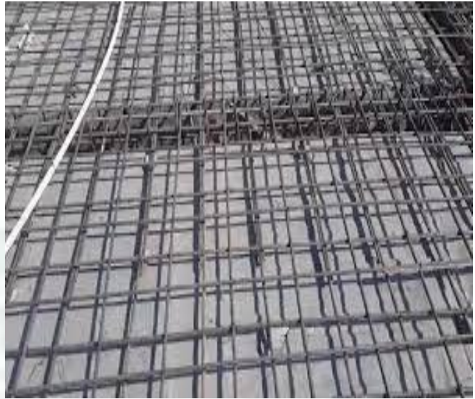
Slab reinforcement detailing on the site